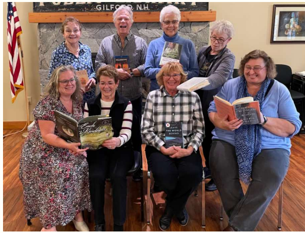
~The Friends of the Gilford Public Library Board

Click the button to see information about planned giving.