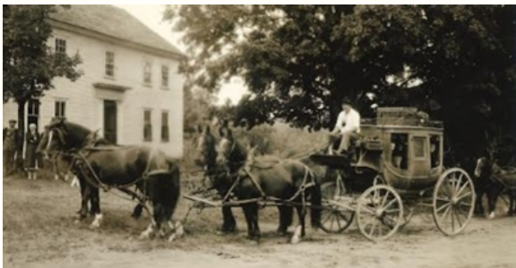
Establishment of public library for Gilford at the Deacon Hunter House in 1894.