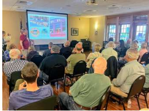
Friends' Bookstore remodeled, 2024. A shared community space!

Following on the heels of the Library's Early Release Halloween activity, the Friends sponsored the traditional Halloween Spooky Story Walk at the library. We so appreciate all the volunteers that helped with this event!