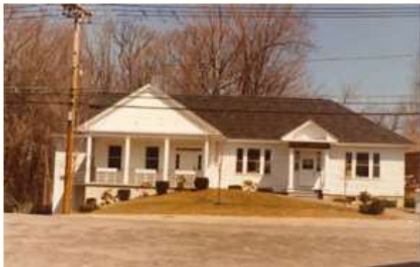
Library at Belknap Mt. Road, 1984.